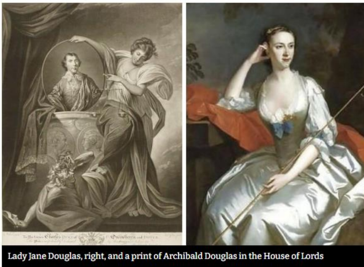
Lady Jane Douglas, right, and a print of Archibald Douglas in the House of Lords

Sir Herbert Maxwell in his History of the House of Douglas also tells of the run-up to the Cause.