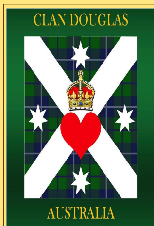
The Clan Douglas 'Southern Cross'.

The international smash hit event features singers, dancers, pipe-band and drum corps, and soloists.