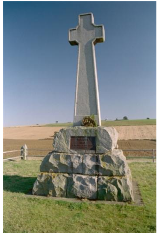
Flodden Monument - Inscription 'Battle of Flodden 1513 to the dead of both nations Erected 1910'.