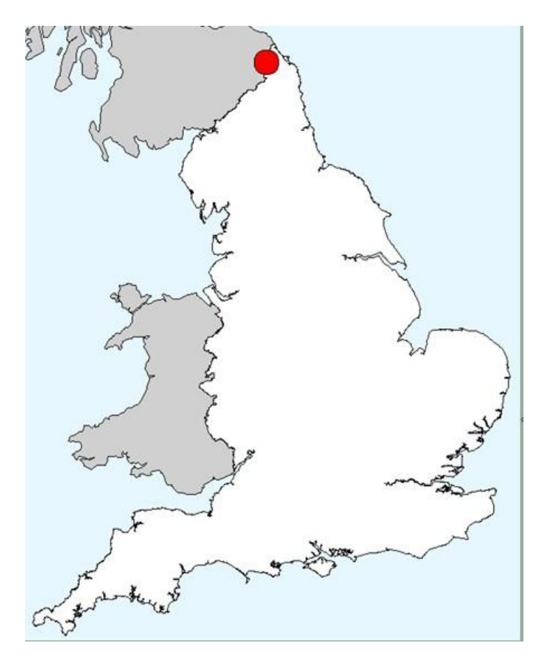
Flodden National Location Map.