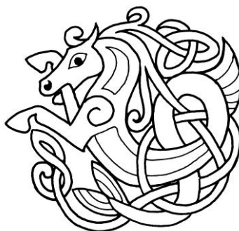
An example of a Celtic Design

(Taken from the Clan Johnston/e Association of Australia Newsletter, June, Winter 2009 Issue 72, p.10)