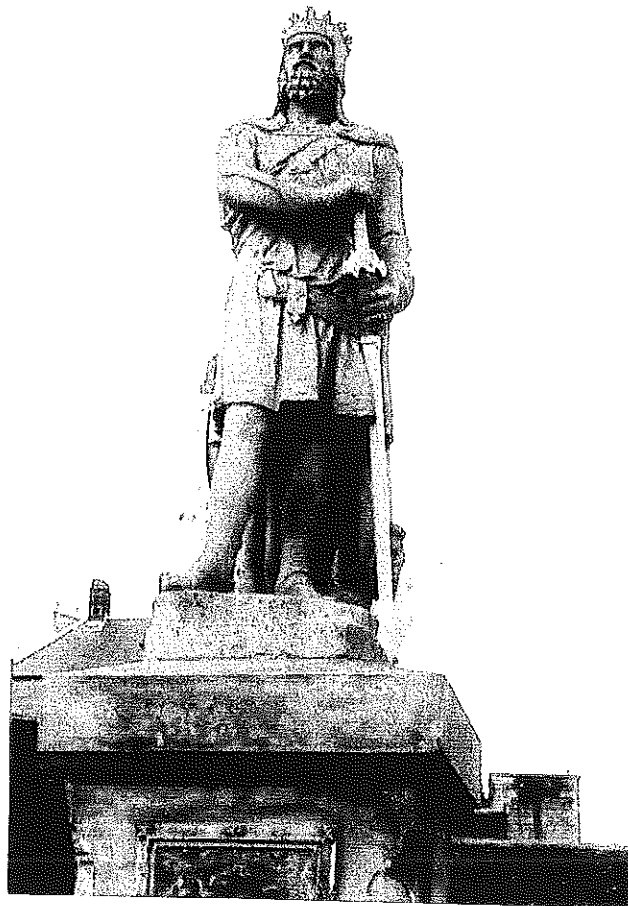
ROBERT THE BRUCE