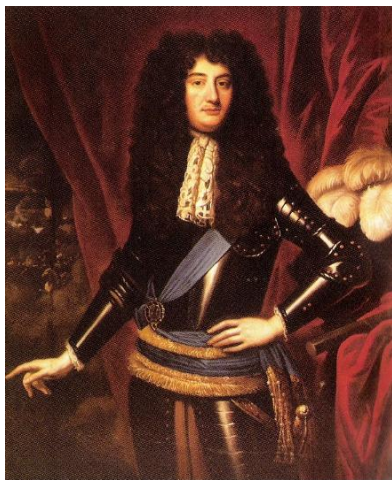
William Douglas, Duke of Hamilton, portrait by G. Kneller, Lennoxlove.