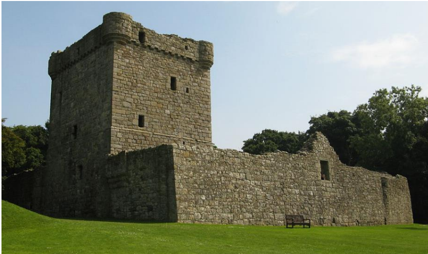
Loch Leven Castle - Exterior view of the west wall and keep. Jonathan Oldenbuck. CC BY-SA 3.0

https://en.wikipedia.org/wiki/Loch_Leven_Castle#/media/File:Lochleven_west_wall.JPG