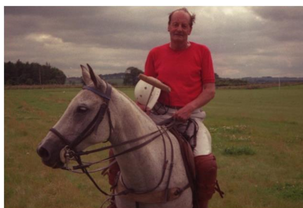
Polo player, cattle breeder and energetic servant of West Lothian as Lord Lieutenant

His formal education ended when he was 17 and within three years he had built up a transport business which gave him the time and funds to study veterinary science in Edinburgh and set up as a Wiltshire farmer with his own livestock company, trading with particular success in Ireland. So began his life-long interest in breeding cattle and farming. He proved an able farmer and cattle breeder, owning land both in Scotland and England: in the latter his farm in Wiltshire was particularly innovative after he founded his own livestock company.