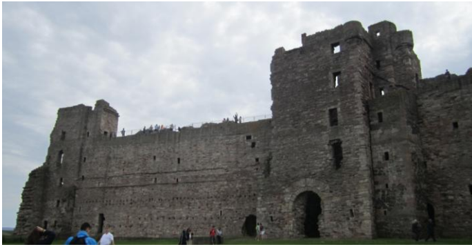
Inner face of the curtain wall from the north range with Douglas Tower to the left.