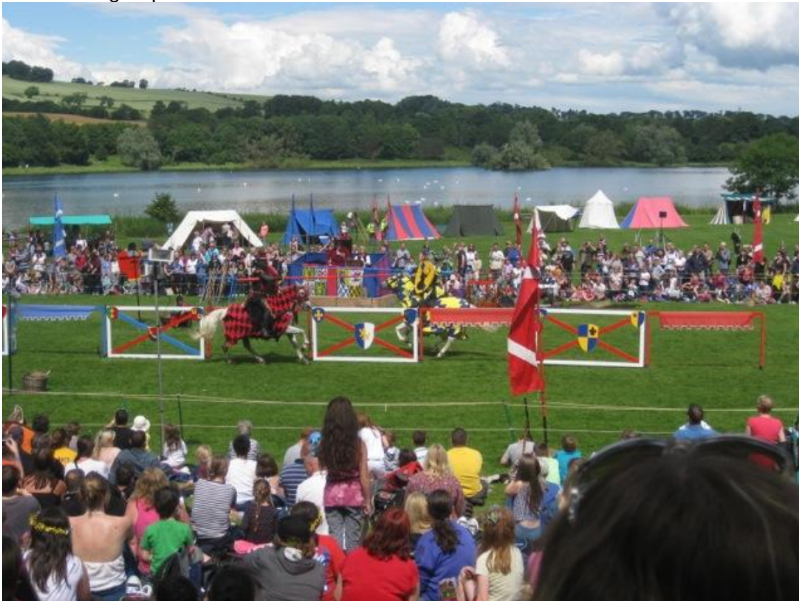
Photo taken at Linlithgow Jousting Tournament, 2014

The joust became an iconic characteristic of chivalrous knights in medieval times, sometimes with romantic connotations as often jousting duels were fought over the love of a lady. Jousts were also often intended to train young knights for real warfare and to keep established knights in practice. The term 'joust' originally meant 'to approach' or 'to meet' and as we watched at Linlithgow Palace, the knights were approaching each other at full gallop.