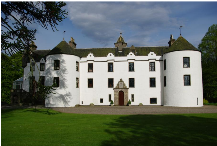
Glenbervie House