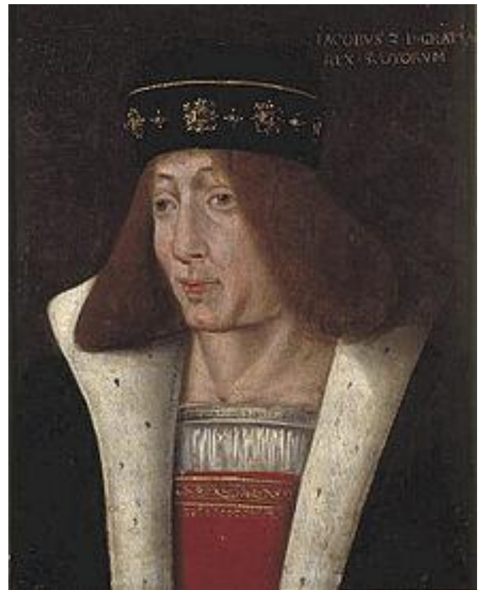
James II of Scotland

But Scottish tides turn with the devious whispering influence of enemies and so in 1452, William was summoned to attend the King at Stirling (by this time the King was twenty-two and nicknamed "Fiery Face" because of a red birthmark on his face, thought to be also a sign of a fiery temper).