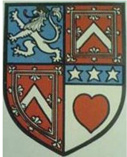
Arms of William Douglas, Earl of Wigtown and 6 th Earl of Douglas

This Black Douglas family lived at Threave Castle and although their mother had re-married, she was still known as the Countess of Douglas. With all his titles, William's estates were wealthy and large and he had a magnificent retinue of knights and followers - an army of great numbers if needed. This was the background of the young Margaret Douglas, living in the stronghold of Threave Castle with other nobles and many servants.